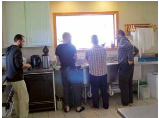
Washing the dishes and purifying the mind at Ryumonji.