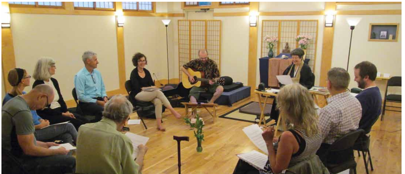
Our summer class on “The Wonderful Teachings of Thich Nhat Hanh” included mindfulness songs from the Plum Village tradition.